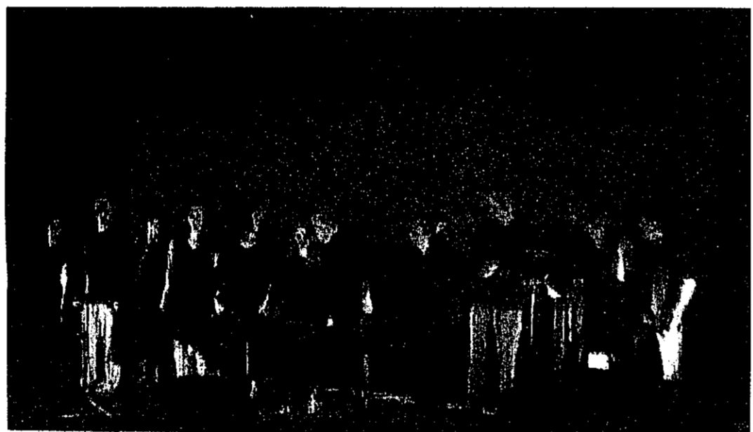
The cast takes a bow at the end of the show.

The cast did a terrific job in entertaining the audience. The piano accompaniment was excellent. There were some outstand-